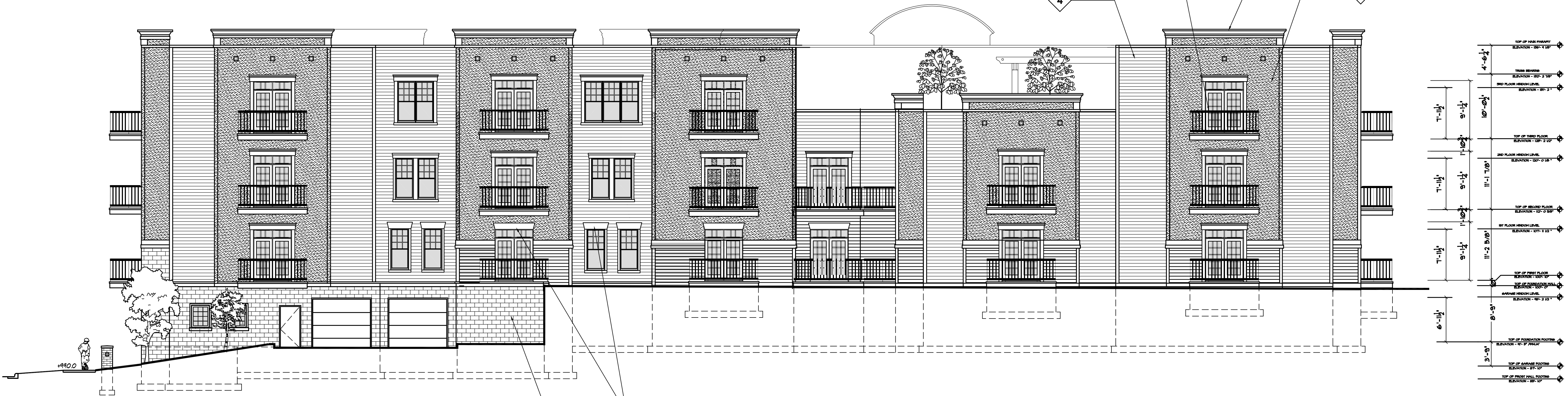
1 SOUTH ELEVATION: A20 1/8" = 1'-0"