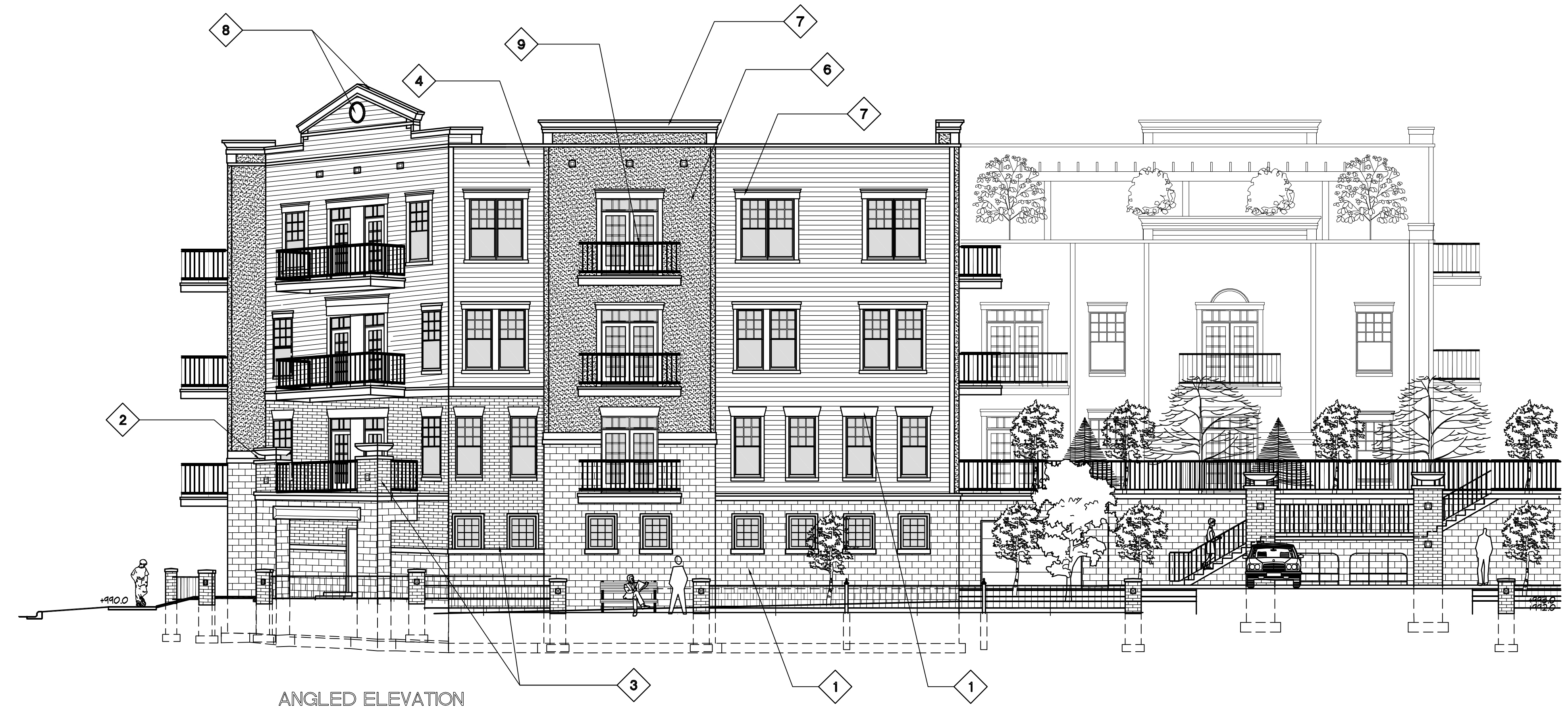
1 JUPITER DRIVE FACADE A20 1/8" = 1'-0" WEST ELEVATION