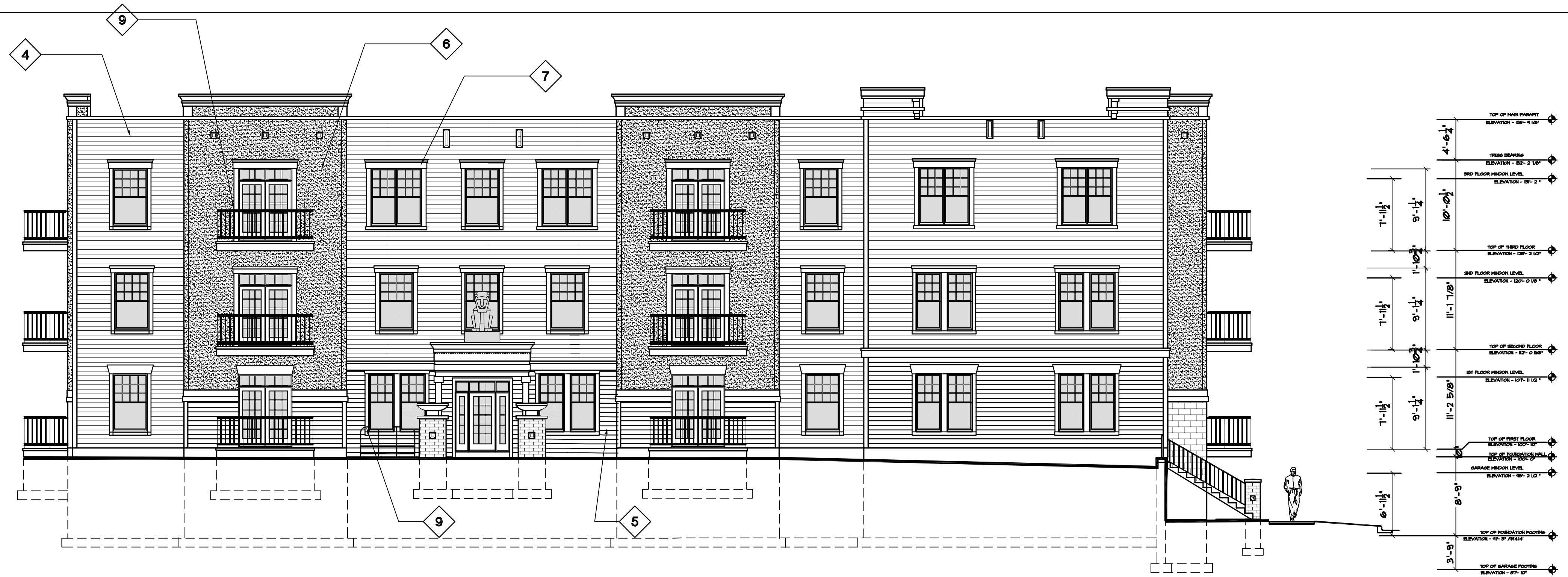
1 EAST ELEVATION A19 1/8" = 1'-0" FACING REAR PARKING